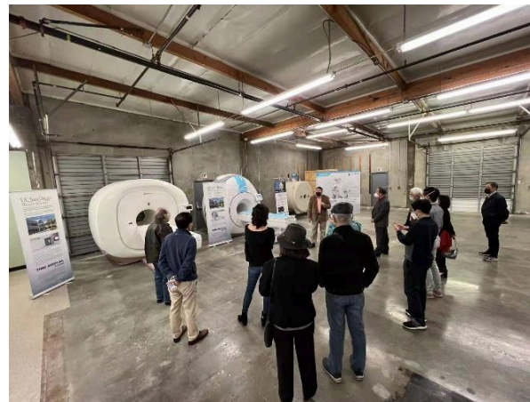
Guests toured the product showroom in the U.S. headquarters